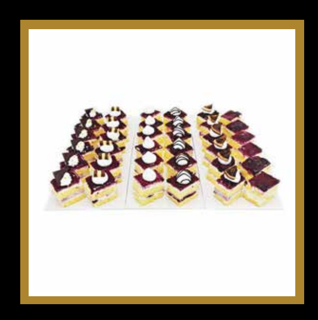
TR0006 Blueberry Cheesecake A classic creamy cheesecake center topped with blueberry, and a buttered biscuit crust