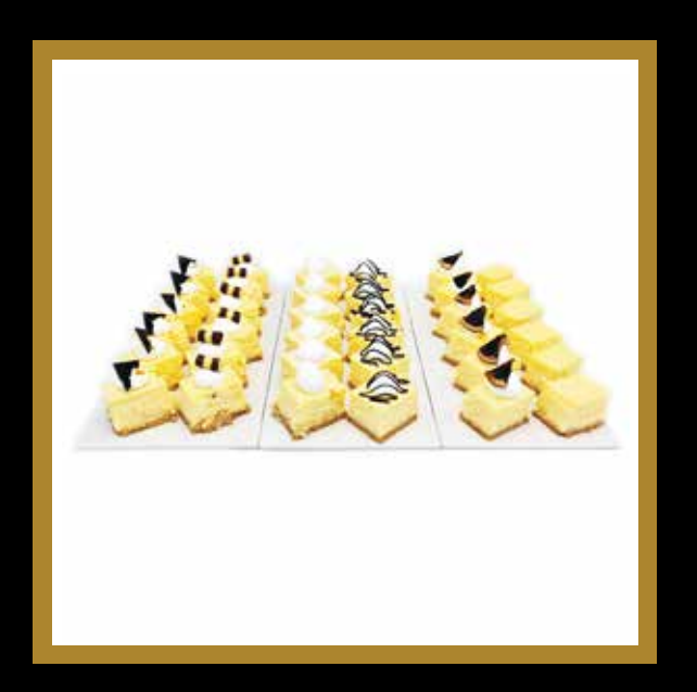
TR0005 Classic New York Cheesecake An ultra rich, tangy, thick, creamy, and smooth baked cheesecake with salted biscuit crust.