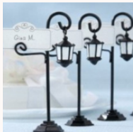
LAMP POST PLACE CARD HOLDER