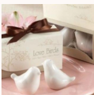
LOVE BIRD PEPPER AND SALT SHAKER