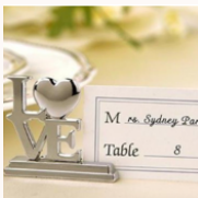
L.O.V.E CARD HOLDER