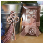
VINTAGE KEY BOTTLE OPENER