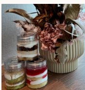
ASSORTED TRIFFIN CAKE