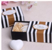
LOVE SHAPE HAND SOAP