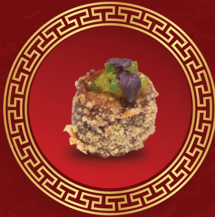
金牌宫爆鸡卷 Kung Pao Chicken Roulade with Cashew Nut Mousseline

6 ITEMS - $30 | 7 ITEMS - $35 | 8 ITEMS - $40 PER GUEST (MINIMUM 30 GUESTS)