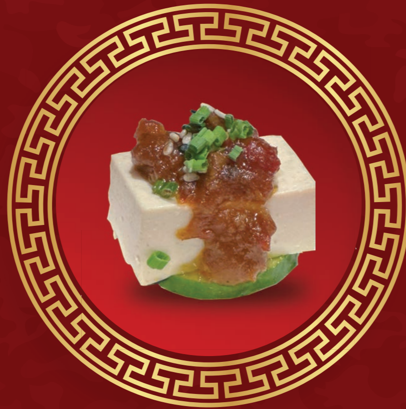
酱香素麻婆豆腐(素) Vegetarian Mapo Tofu (VG)