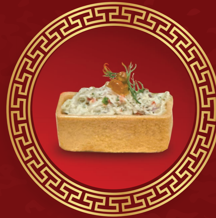
柠檬香蟹挞 Lemongrass Crab Tart

Shrimp, Scallop, Fish Maw, Shimeiji Mushrooms, Cabbage, Black Moss, Tossed with a Premium Abalone Sauce