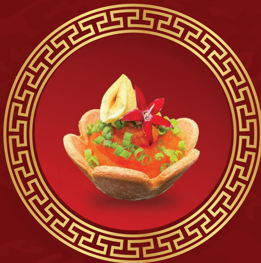
金牌宫爆鸡卷 Chinese Five Spice Sweet Potato Tart (VG)

Home Smoked Duck Breast, Cucumber Slice, Leek Slice