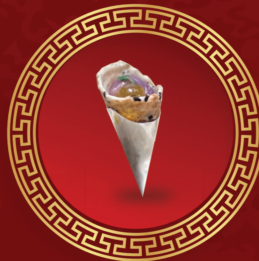
金典芋泥锥 Premium Orh-Nee Cone