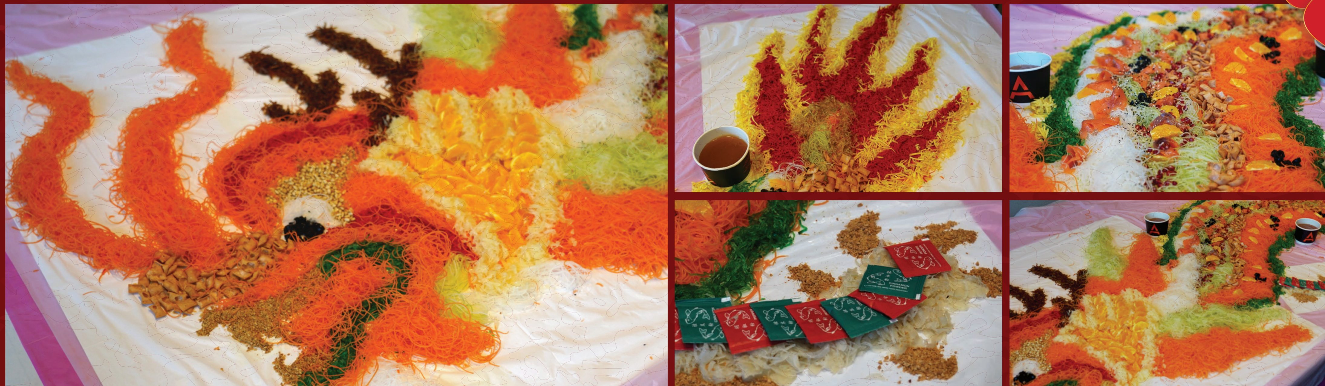
龙腾盛世鱼生 Prosperous Dragon's Leap Yu Sheng

6 FT. $388 | GOOD FOR 12 PAX 12 FT. $588 | GOOD FOR 24 PAX 24 FT. $888 | GOOD FOR 48 PAX