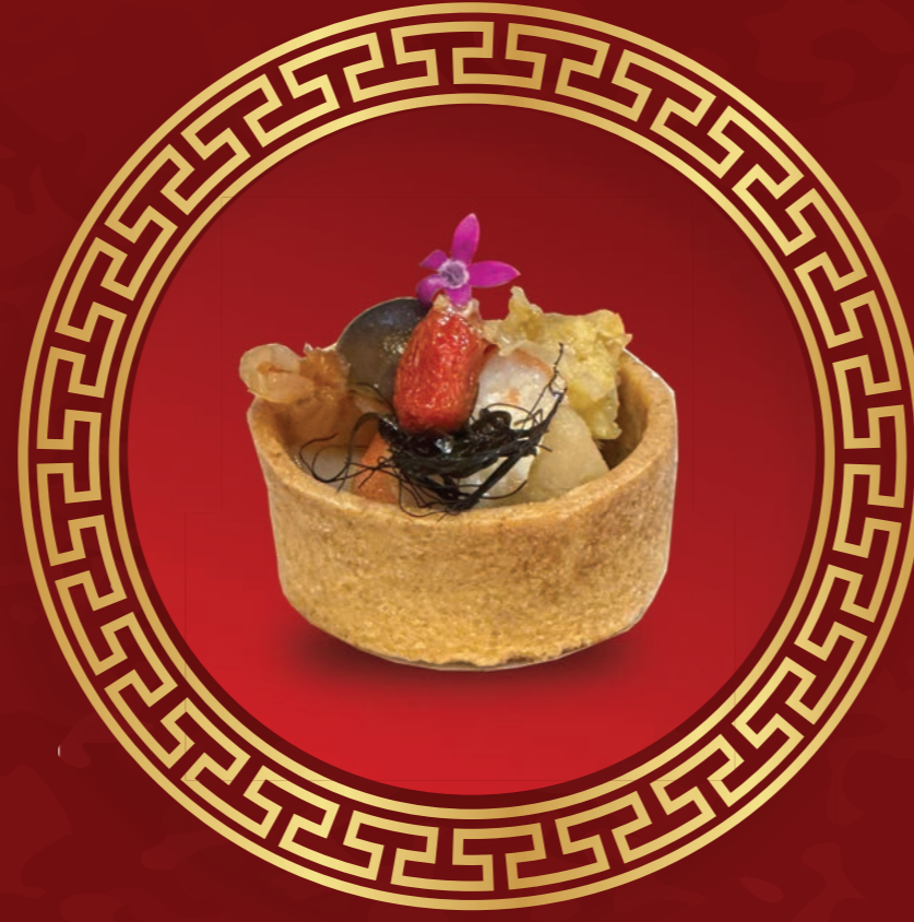
迷你丰收海味盆菜挞 Mini Seafood Pen Cai Tartlet

Shrimp, Scallop, Fish Maw, Shimeiji Mushrooms, Cabbage, Black Moss, Tossed with a Premium Abalone Sauce