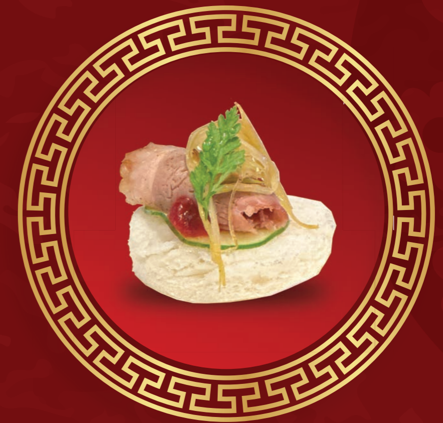
烟香橡木烟鸭仙子包 Open Faced Oak Chip Smoked Duck Breast Mantou

Lemongrass, Lime Jazz, Crab Meat, Black Pepper