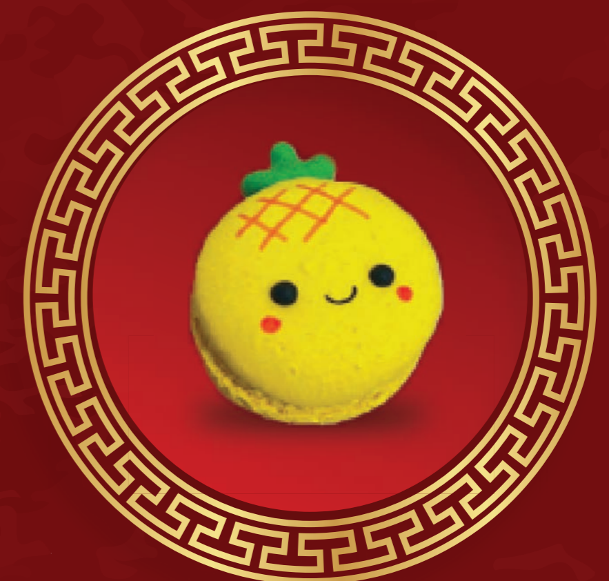
欢乐芒松马卡龙 Joyful Mango Pine Macaron

We cannot guarantee the absence and traces of nuts or other allergens. Please advise our personnel if you have any specific dietary requirements.