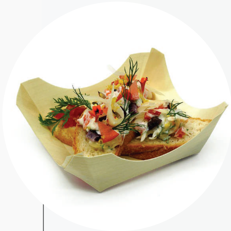
BRUSCHETTA W DUO TOPPINGS *Grilled Octopus w Fresh Plum Tomato Salsa *Lobster Meat Tossed w Celery Mayo Dill and Old Bay