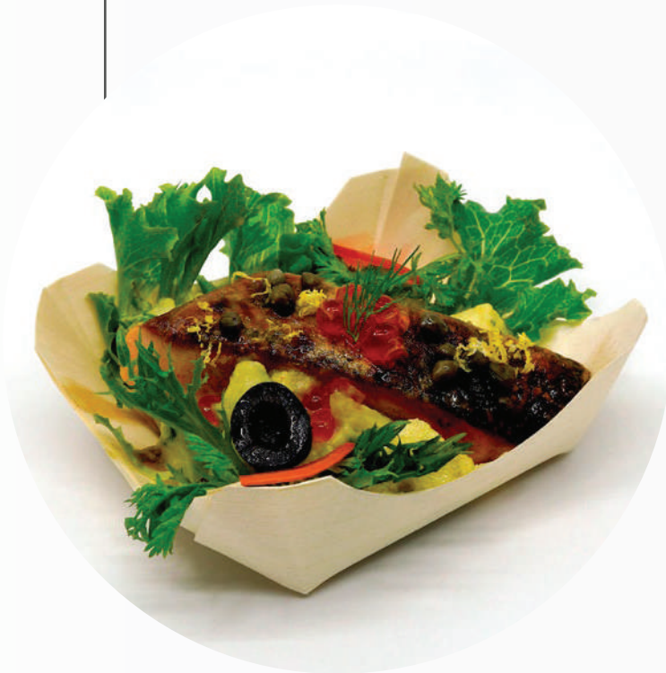
ROASTED SALMON W AVOCADO CHIMICHURRI Fresh Lemon, Capers, Pickle Radish and Caviar