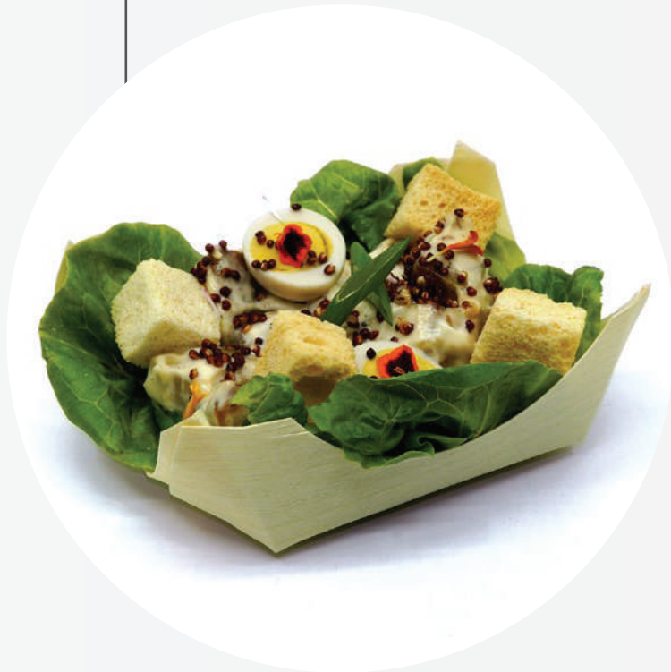
GERMAN POTATO SALAD Romaine, Garlic Aioli, Spring Onion and Quail Eggs